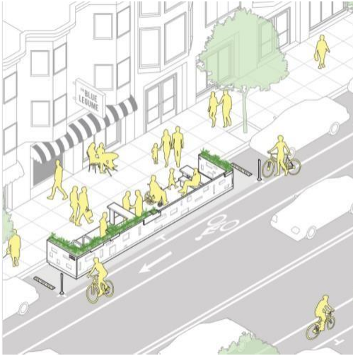
EXHIBIT 2 – Possible Options