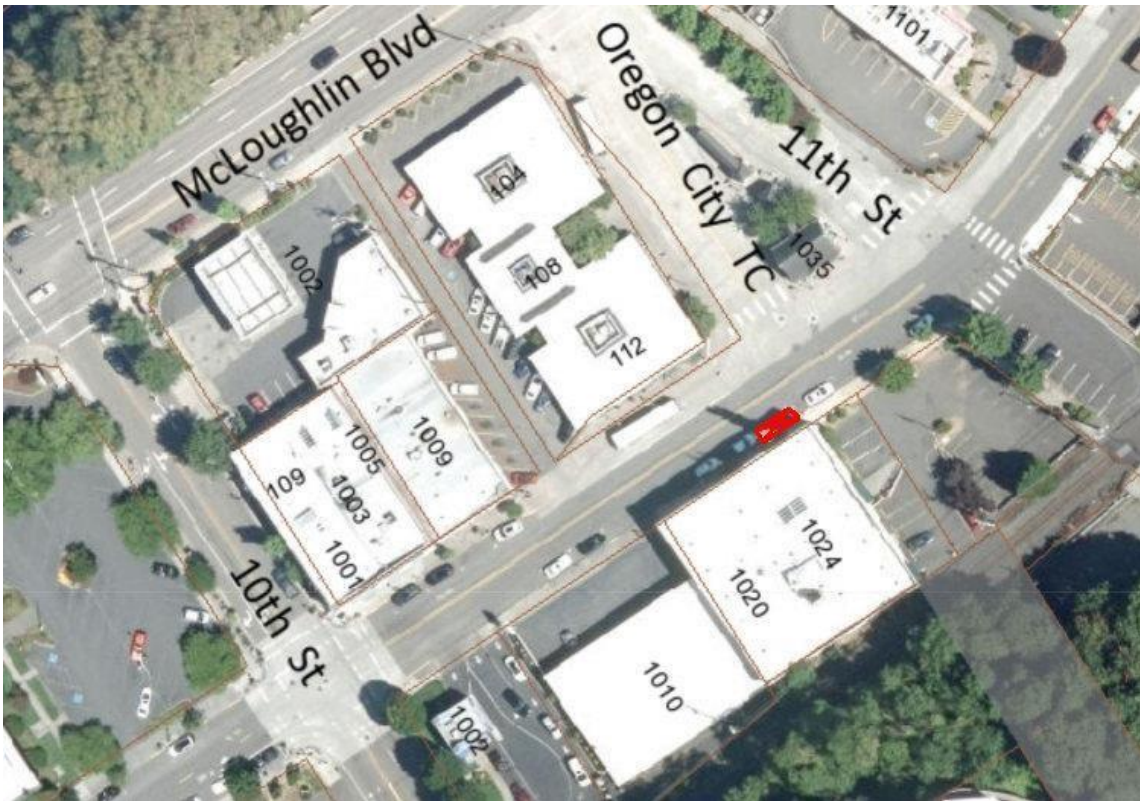
Main Street from 10 th Street to 11 th Street