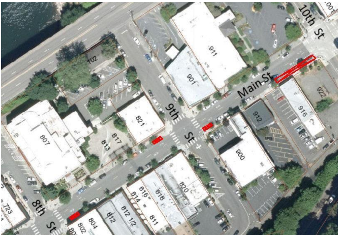
Main Street from 8 th Street to 10 th Street