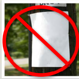
Posters or banners