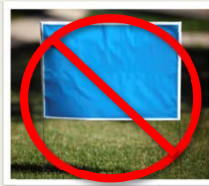
Lawn signs in right-of-way