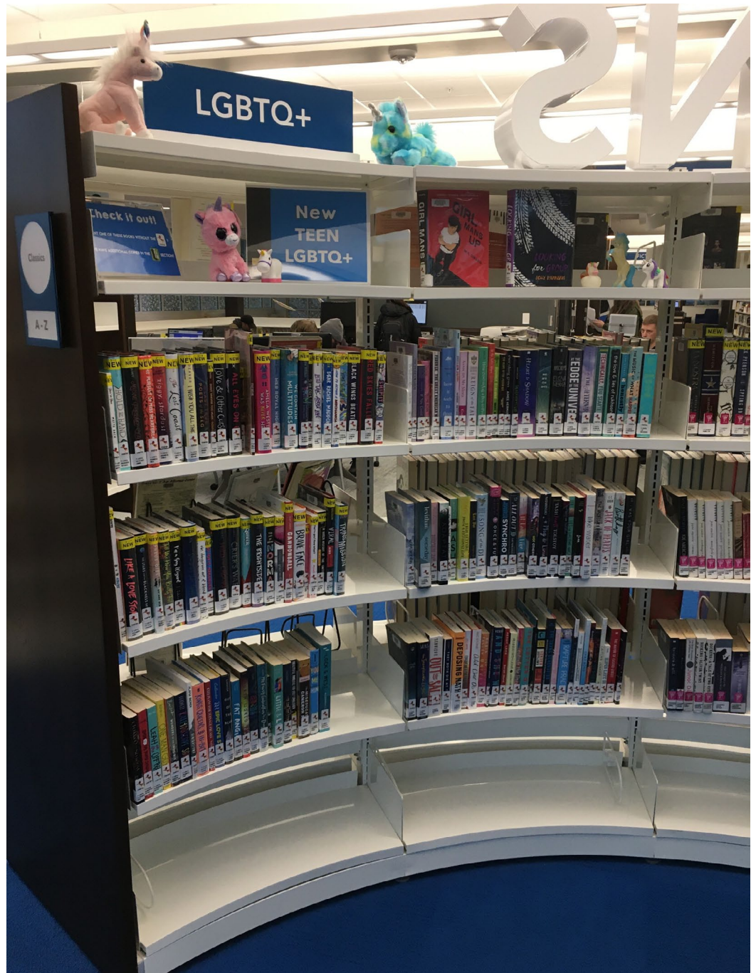
Our Teen LGBTQ section, adorned with unicorns for the article photoshoot, fills two shelves in the center of the library's Teen Area.

A note about terminology: For the sake of brevity, we use the word “teen” to describe LGBTQ youth throughout this article.